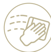
REINFORCED FREQUENT DISINFECTION