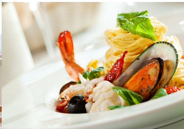
Daily Meals prepared by our Culinary Team