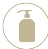
HAND SANITISER PROVIDED IN PUBLIC AREAS