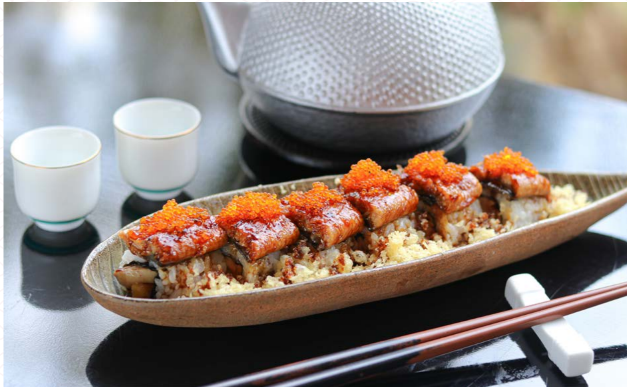
UNAGI FOIE GRAS ROLL