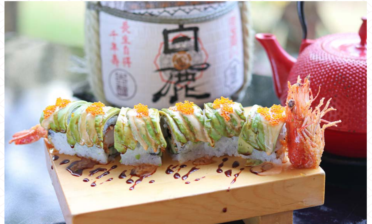
EBI TEMPURA & AVOCADO ROLL