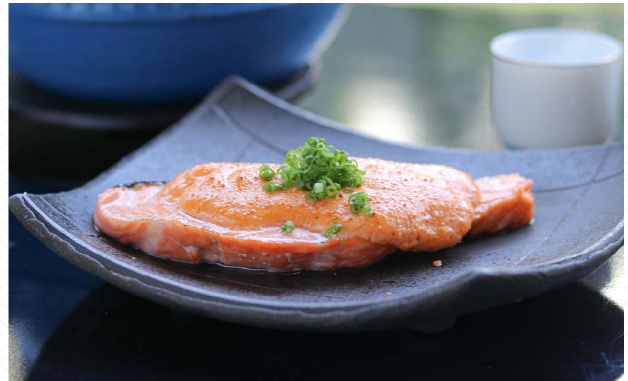
MENTIAKO SALMON YAKI