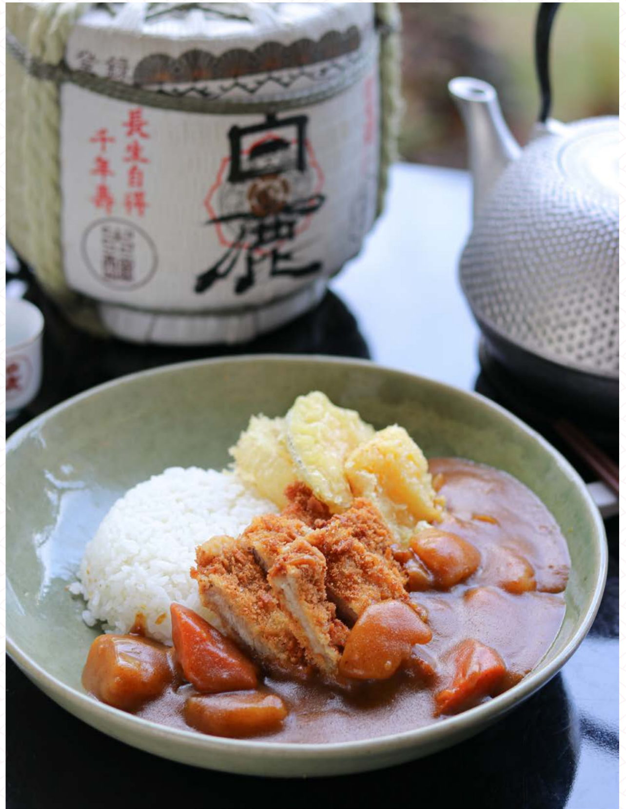
PORK CURRY DON