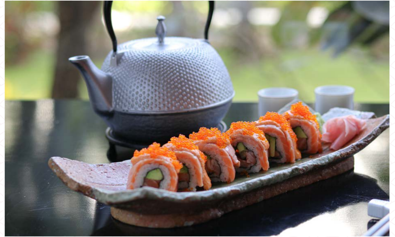
SALMON MENTIAKO ROLL