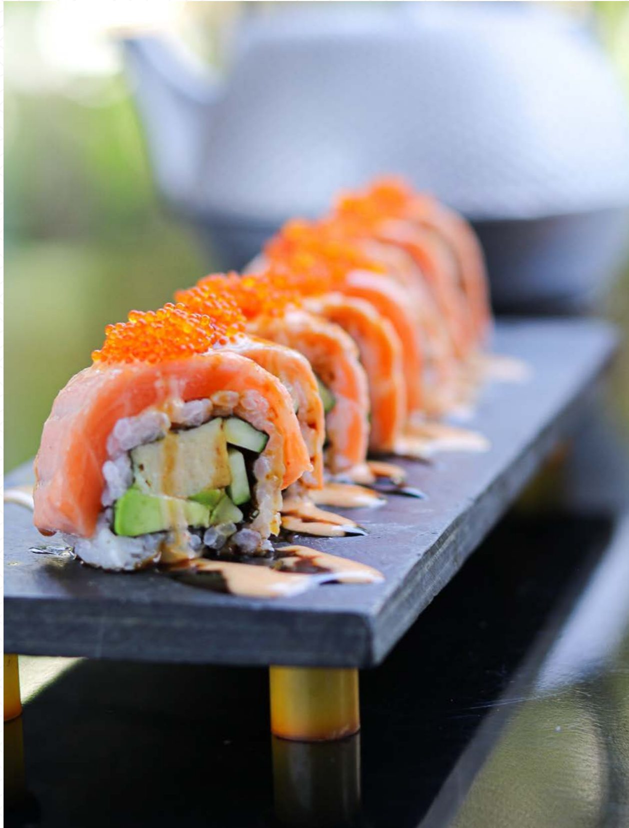
SPICY SALMON ROLL