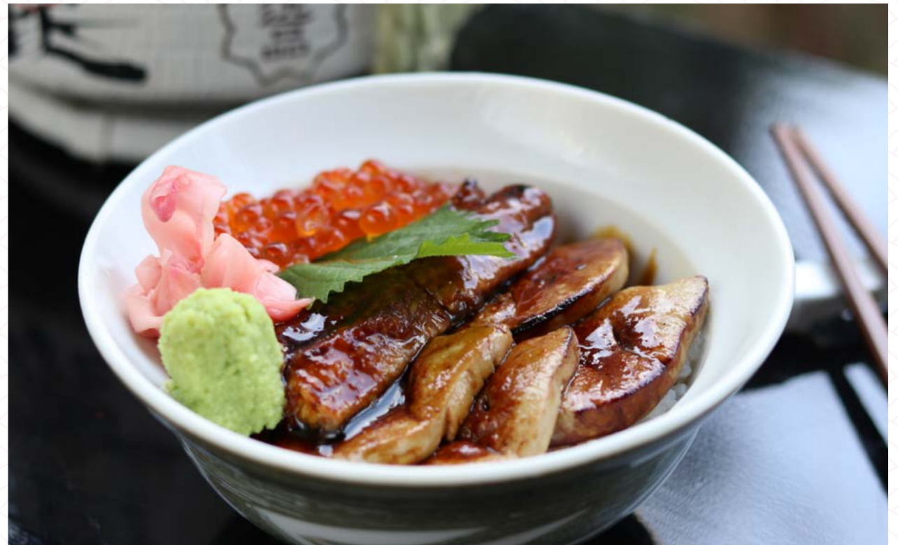
UNAGI FOIE GRAS DON