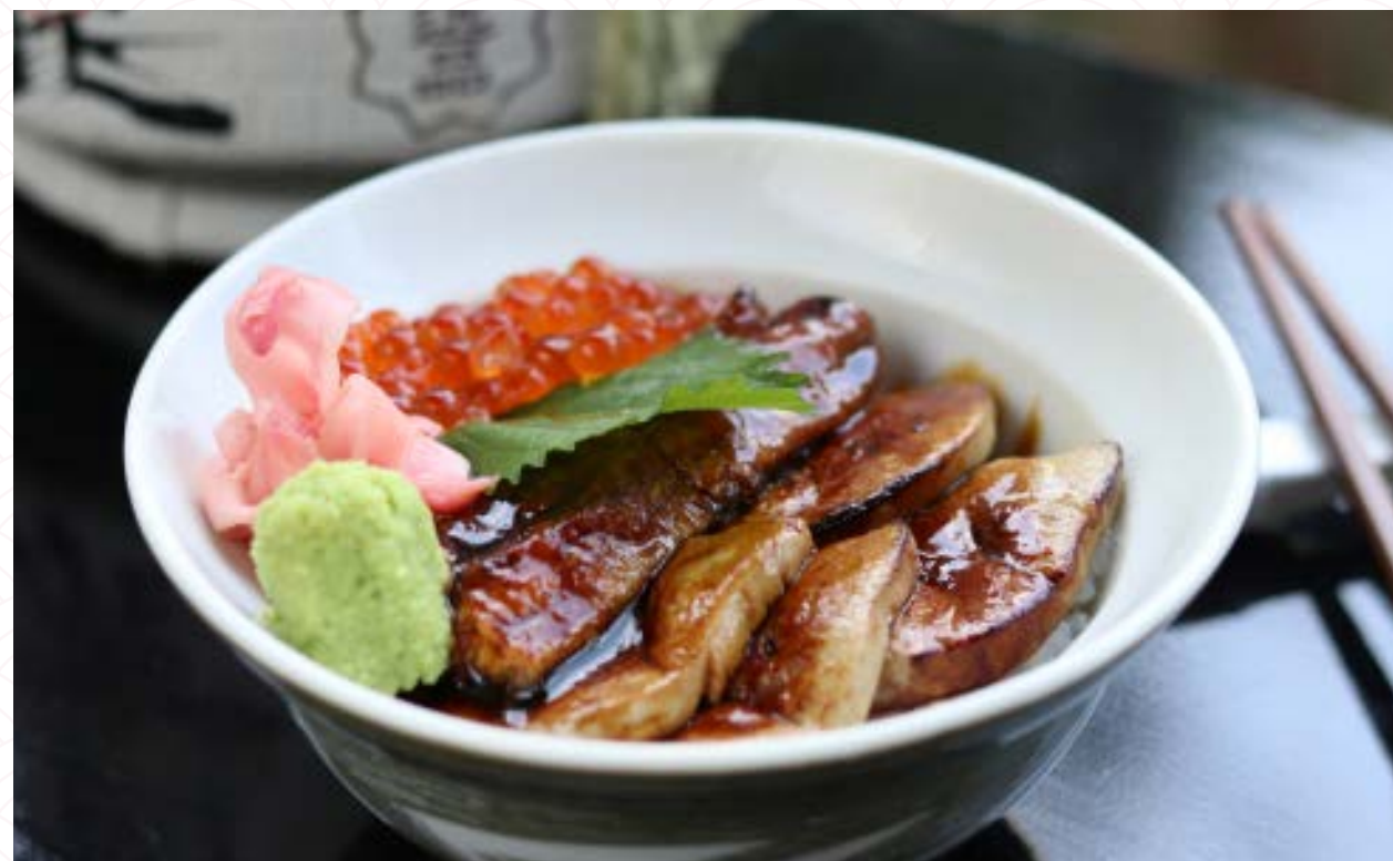
UNAGI FOIE GRAS DON