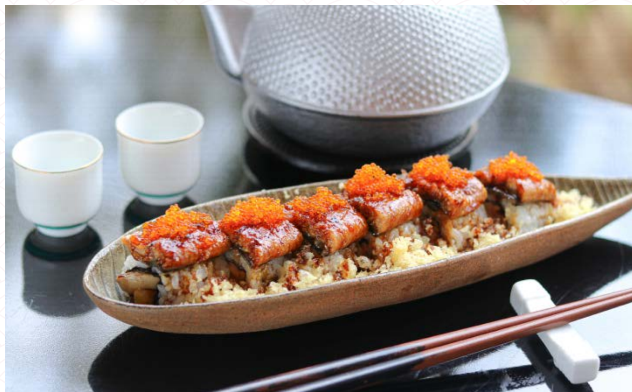
UNAGI FOIE GRAS ROLL