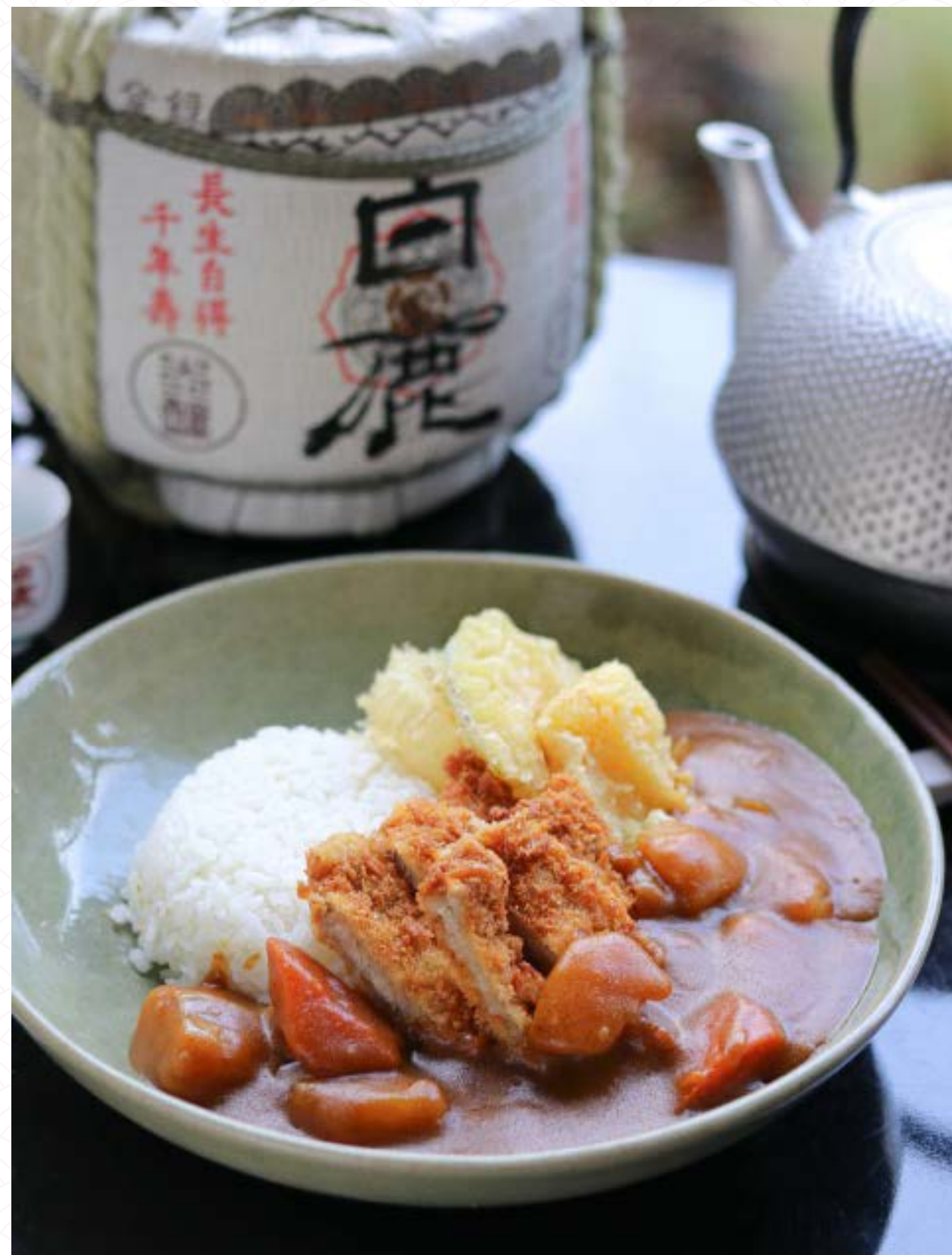
PORK CURRY DON