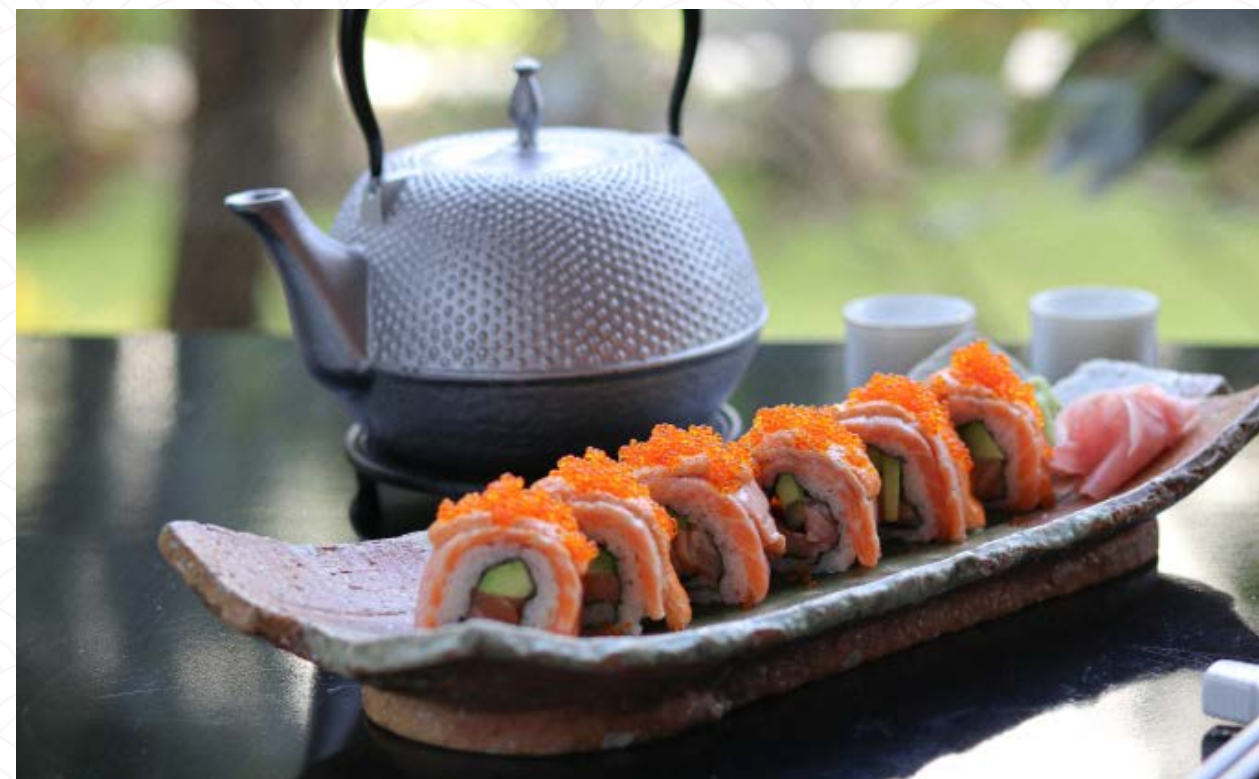
SALMON MENTIAKO ROLL