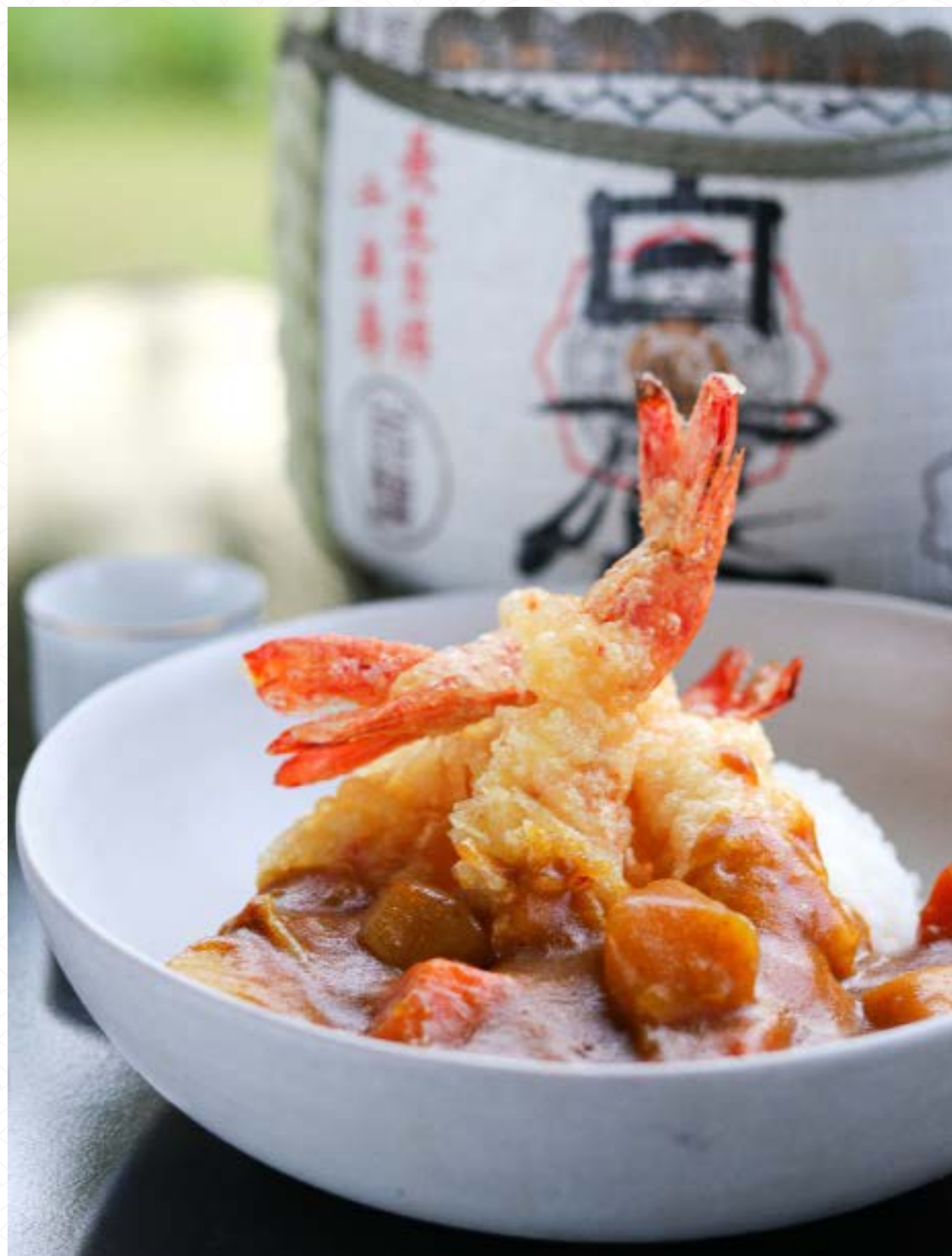
TEMPURA SHRIMP CURRY