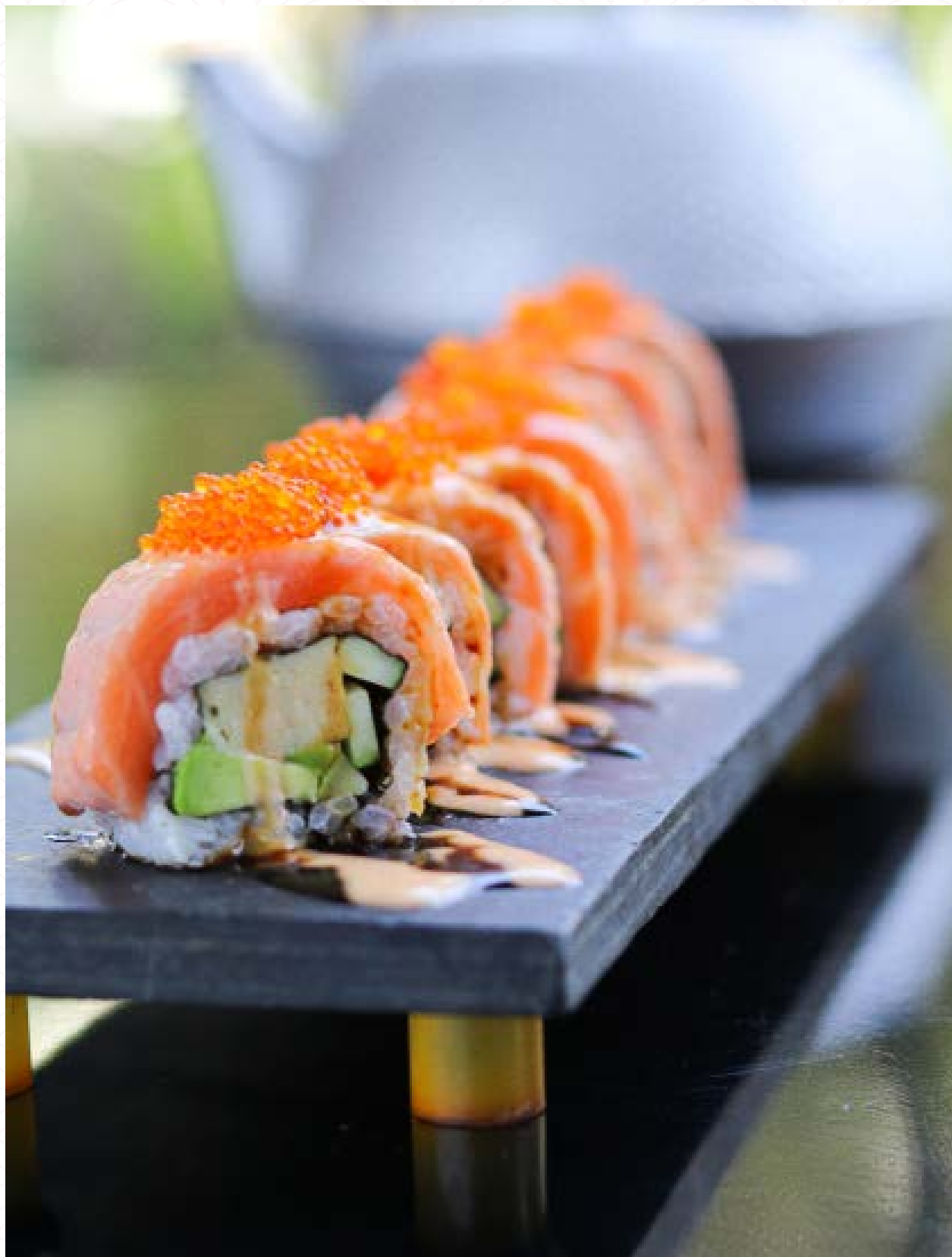
SPICY SALMON ROLL