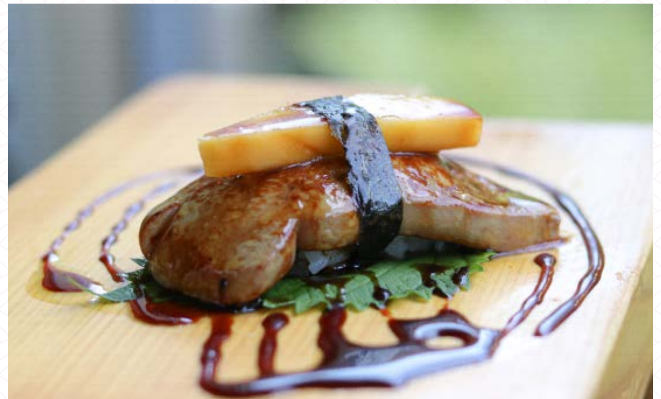
FOIE GRAS MANGO SUSHI