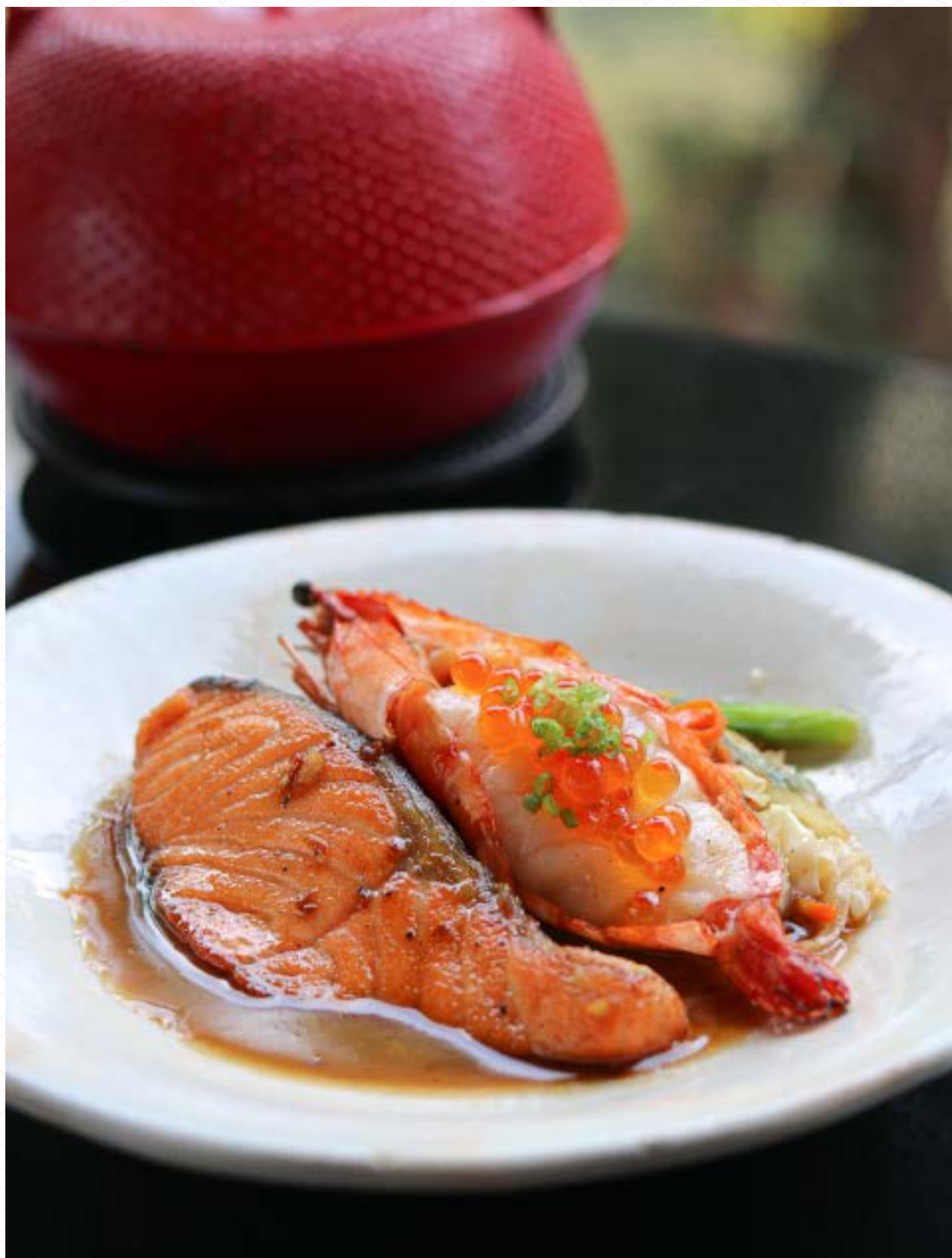
EBI SALMON STEAK