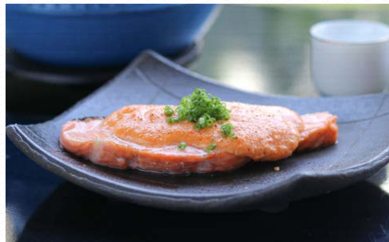
MENTIAKO SALMON YAKI