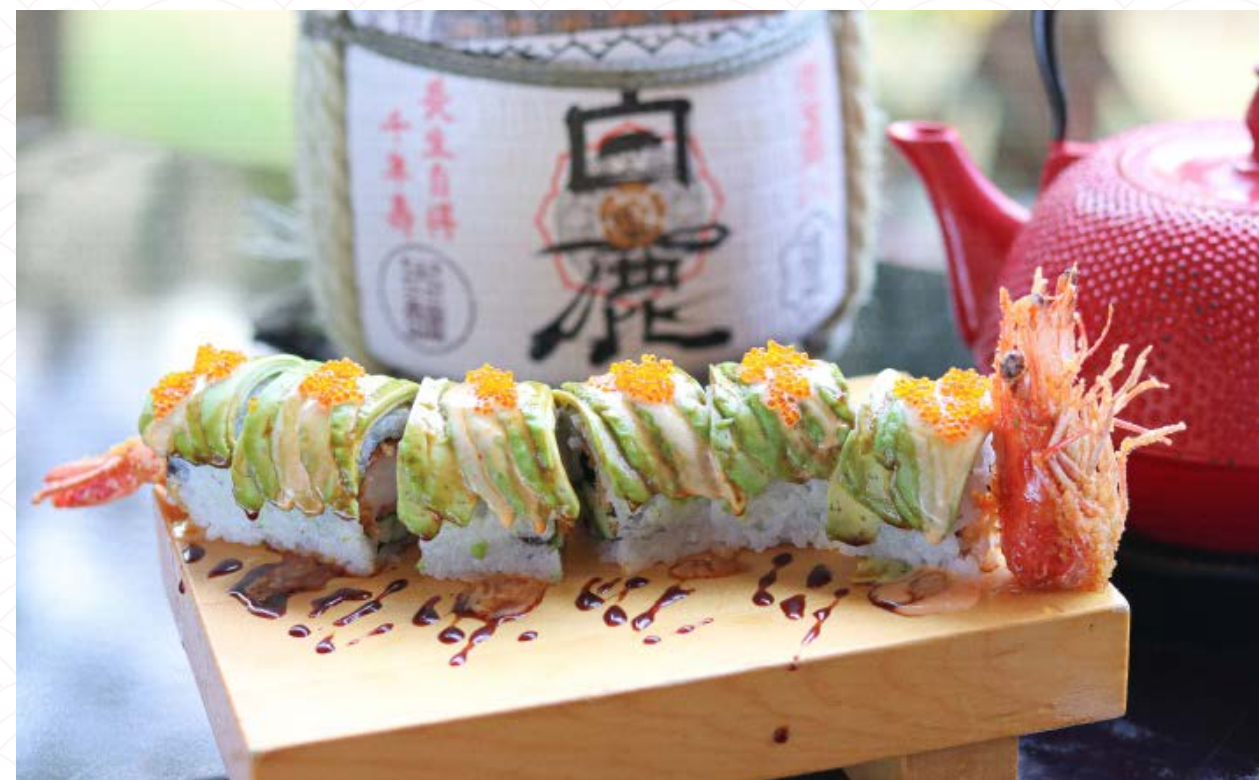
EBI TEMPURA & AVOCADO ROLL